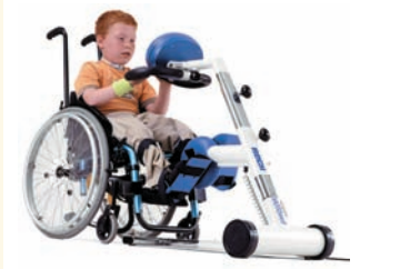
MOTOMed gracile (pediatric unit)

Motor driven, software controlled MovementTherapySystems for people with paralysis, spasticity and physical weakness.