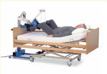
MOTOMed letto (bed unit)