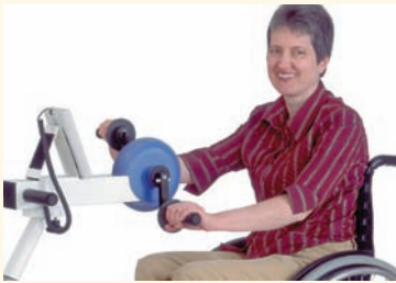
Arm/upper body trainer MOTOMed viva1