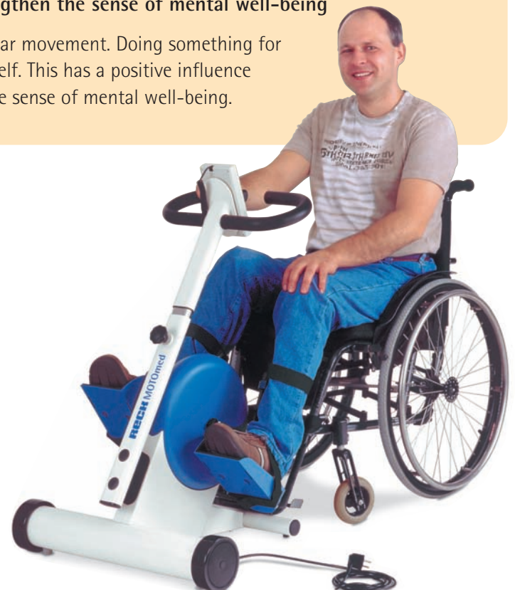
MOTomed viva1 with handlebar and leg guides (accessories)

Regular movement. Doing something for yourself. This has a positive influence on the sense of mental well-being.