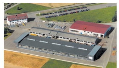
RECK-Technik GmbH & Co. KG, Betzenweiler, GERMANY