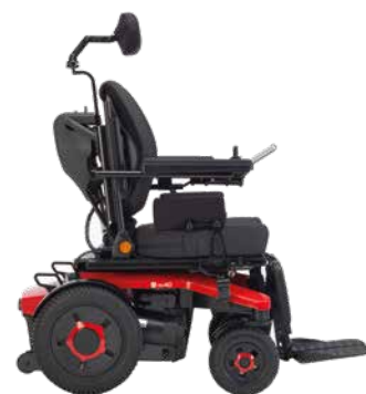
AVIVA RX 40+ Ultra Low Maxx

The higher maximum user weight and wide seating options make this suitable for the larger clientele.