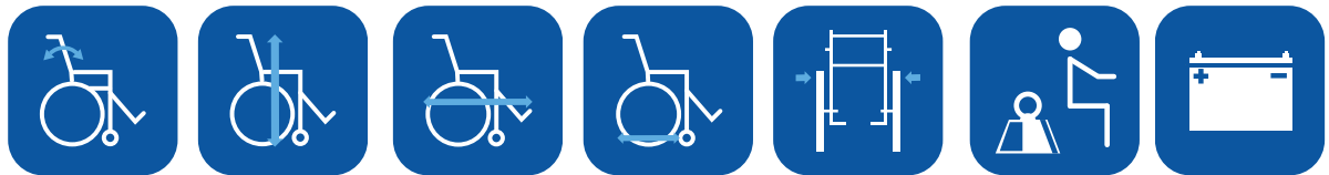
Backrest angle ▼ Total height ▼ Total length inc. footrests ▼ Total length without footrests ▼ Driving unit width ▼ Max. user weight ▼ Battery capacity ▼