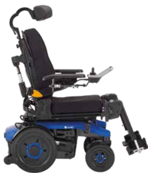
AVIVA RX 40+ Modulite

This entry level drive only powerchair has superb indoor mobility and is ideal for those with less clinically high end needs.