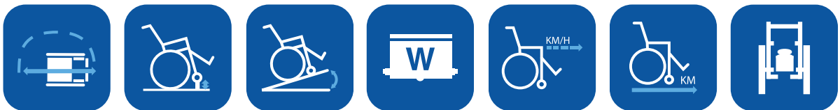
Turning diameter ▼ Max. climbable obstacle height ▼ Max. safe slope ▼ Motor capacity ▼ Speed ▼ Driving range ▼ Total weight ▼