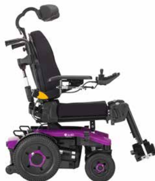
AVIVA RX 40+ Modulite HD

The ideal solution for those that use their chair outdoors as much as they use it indoors and/or require more clinical support.