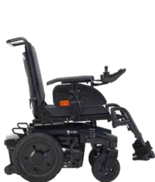
AVIVA RX 20+ One piece